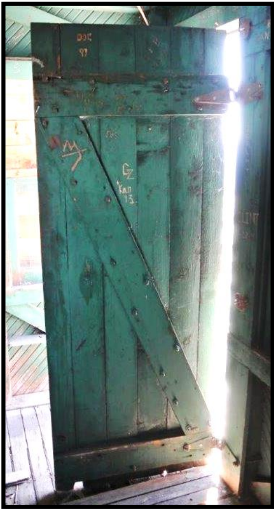
Interior of door.

2015 Bob Myer photographs, USFS Collection.