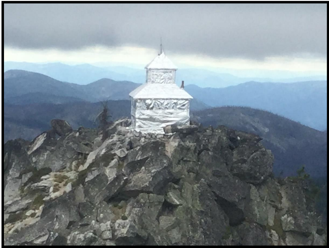
These photographs were taken in 2016 when the lookout was wrapped for fire protection purposes during the Cedar Fire.