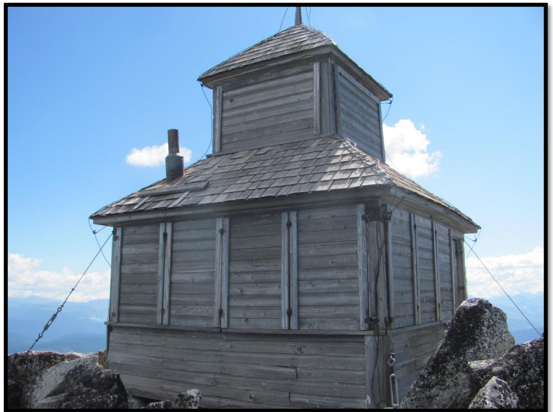
West and south elevation of lookout.