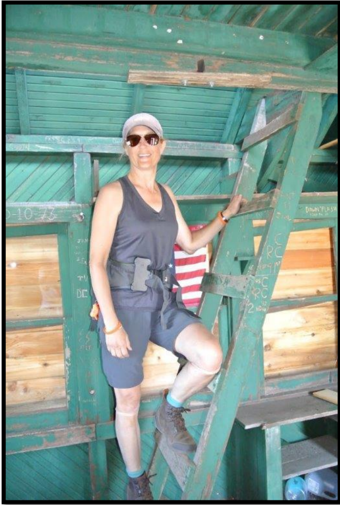
Ladder leading to cupola.