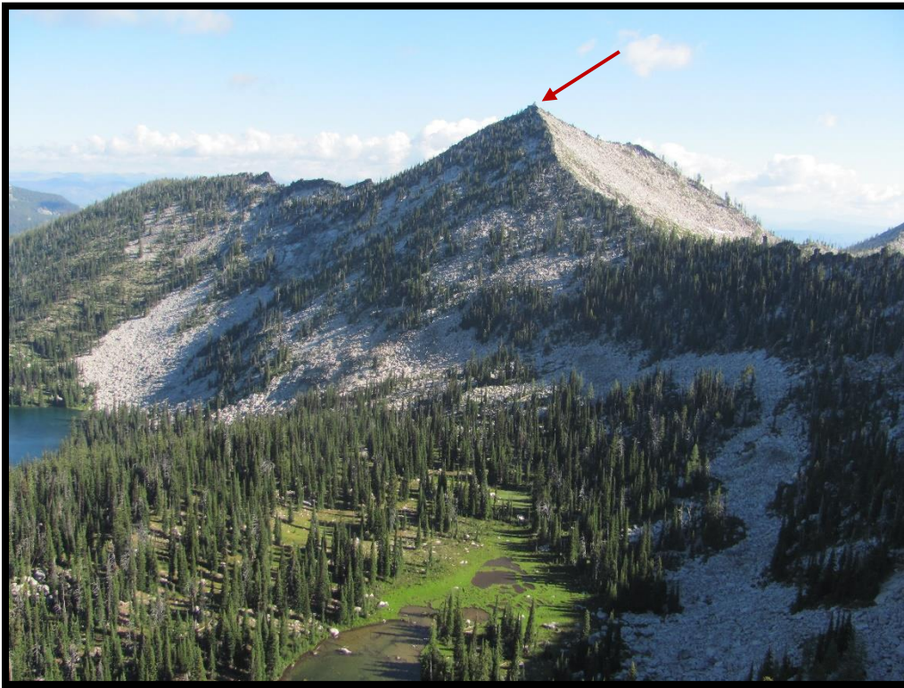
Grave Peak from near Friday Pass, south of the peak.