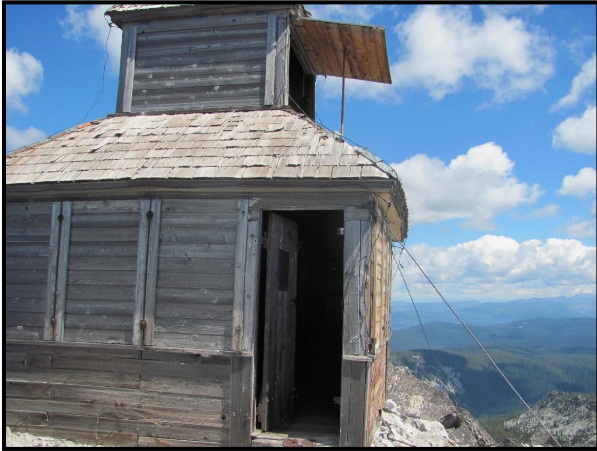
South elevation of lookout with the door and one of the shutters open 2012 USFS photograph.