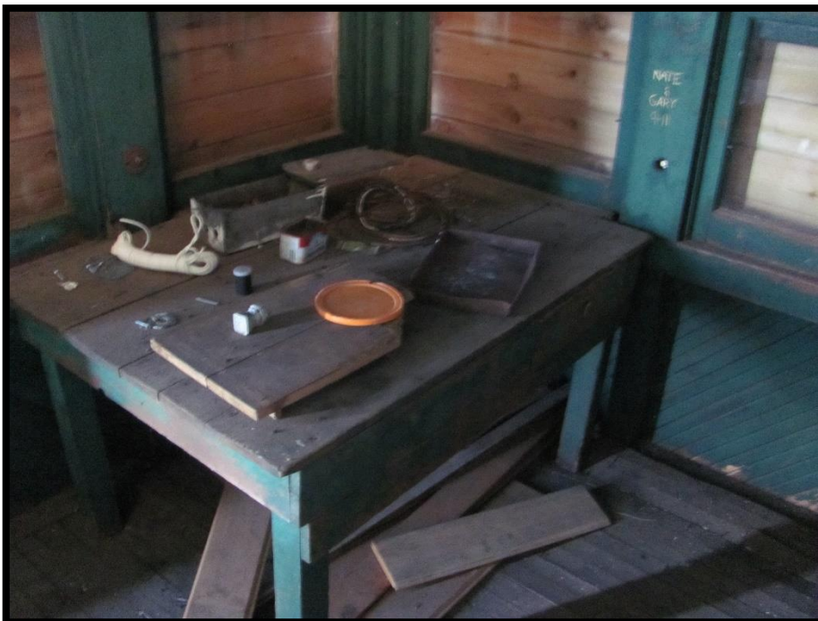
Table located on the interior of the lookout.